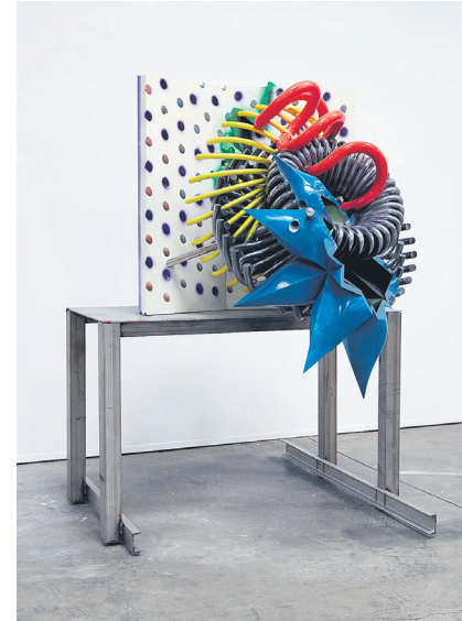
Frank Stella's Puffed Star II and K. 150